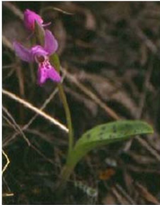
Plate II. An individual plant of Chusua nana