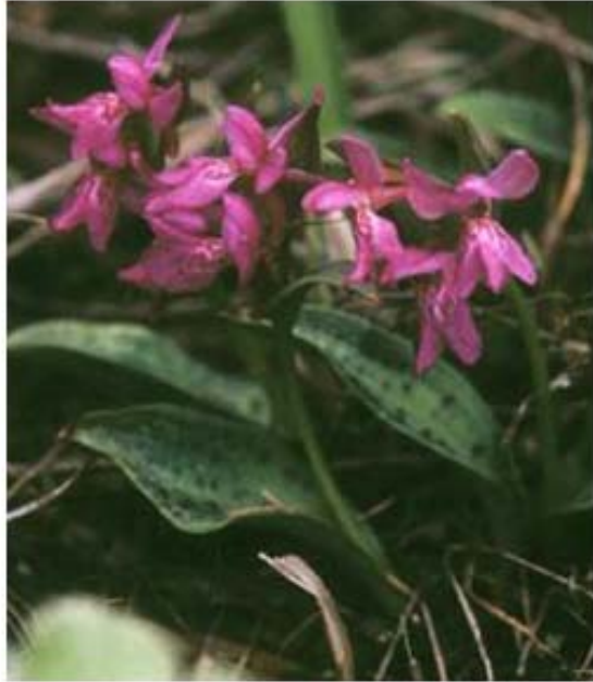
Plate I. Cluster of Chusua nana in an open grassland