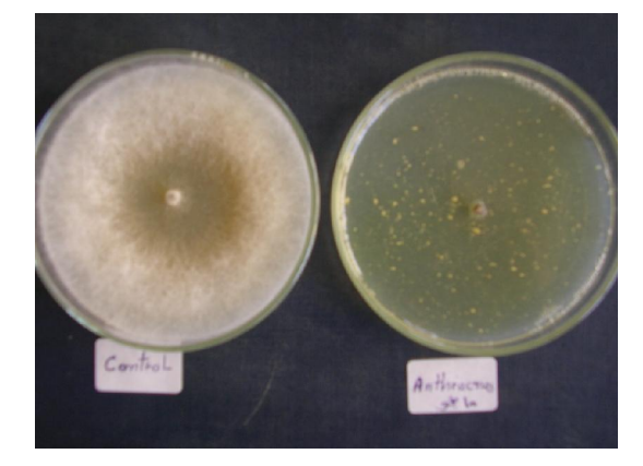
Figure 2, Effect of different concentrations of chitosan on linear growth (mm) and spore germination of C. gloeosporioides : 0.6mg/l (up) and 0.8mg/l (down). Figures with the same letter in the same column are not significantly different (P=0.05). Figures with the same letter in the same column are not significantly different (P=0.05).

Results in Table (3) indicate that all concentrations tested of chitosan significantly reduced the of anthracnose diseases incidence. The percentage of decayed fruits increased by prolonging the storage period, reaching its maximum after 30 days. Chitosan concentrations of 0.05 and 0.1%