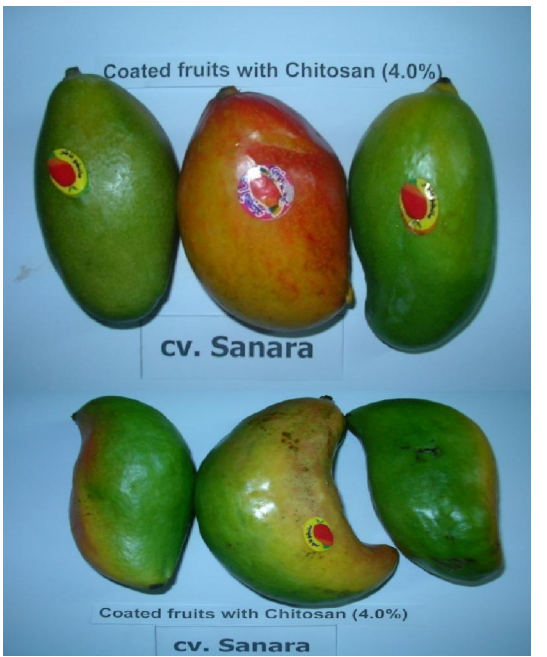
Figure 3, Effect of chitosan coating on anthracnose disease incidence of mango fruits cv.canara during storage period.