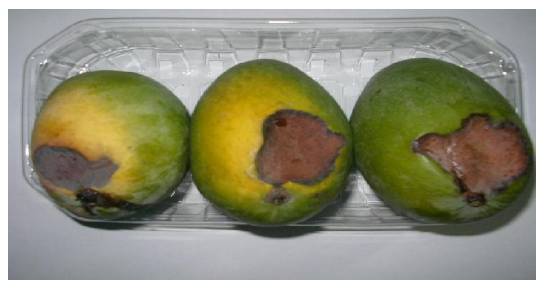
Figure 1, Anthracnose disease symptoms on mango fruits

Anthracnose, caused by Colletotrichum gloeosporioides (Penz.) Penz. And Sacc., is the major postharvest disease of mango in all mango producing areas of the world (Dodd et al. , 1997) and (Swart et al. , 2002). The disease occurs as quiescent infections on immature fruit and the damage it incites is more important in the postharvest period (Muirhead and Gratitude, 1986; Dodd et al. , 1997). Fungicides, either as preharvest or postharvest treatments, form the main approach to reduce losses from anthracnose. However, their use is increasingly restricted due to public concerns over toxic residues. Moreover, fungicides are unaffordable for many mango growers in developing countries (Dodd et al. , 1989).