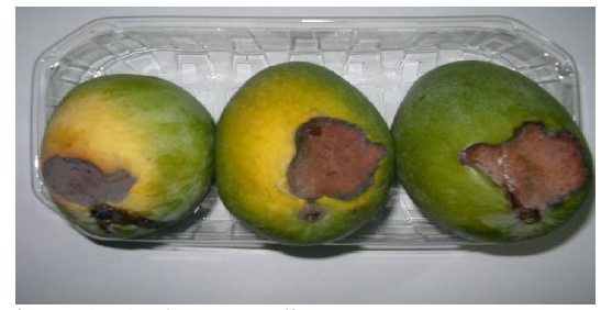
Figure 1, Anthracnose disease symptoms on mango fruits

Anthracnose, caused by Colletotrichum gloeosporioides (Penz.) Penz. And Sacc., is the major postharvest disease of mango in all mango producing areas of the world (Dodd et al. , 1997) and (Swart et al. , 2002). The disease occurs as quiescent infections on immature fruit and the damage it incites is more important in the postharvest period (Muirhead and Gratitude, 1986; Dodd et al. , 1997). Fungicides, either as preharvest or postharvest treatments, form the main approach to reduce losses from anthracnose. However, their use is increasingly restricted due to public concerns over toxic residues. Moreover, fungicides are unaffordable for many mango growers in developing countries (Dodd et al. , 1989).