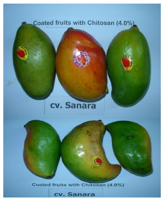
Figure 3, Effect of chitosan coating on anthracnose disease incidence of mango fruits cv.canara during storage period.