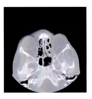
Figure 4 CT scan of the para nasal sinuses 3 months on vorionazole showed interval improvement.