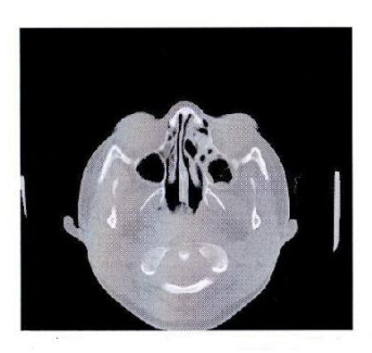
Figure 2 : CT scan of the para nasal sinuses 4 months on itraconazole showed interval improvement.