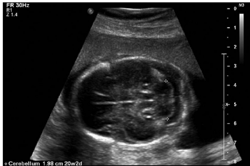
Fig. (1): Measurement of TCD (measurements were obtained by placing the calipers of the ultrasound machine at the outer-to-outer margins of the cerebellum).

All measurements were made by scanning the patients using Sono Ace R3 (Medison company limited) real time ultrasonographic machine with linear and sector array 3.5 MH 2 frequency transducers.