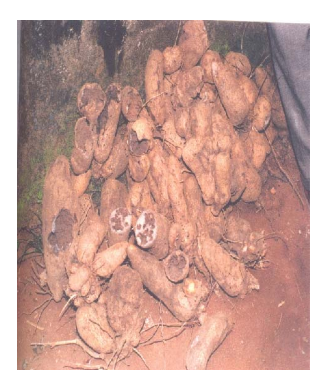
Figure 1. Samples of termite-infested yam tubers.

fix biological nitrogen in the soil of which the estimate of its soil fertility contribution is immeasurable. It of note that good soil fertility helps crop plants to grow well and healthy. Pests and diseases rarely attack healthy crop plants.