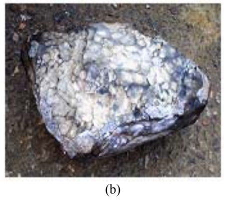
Figure 1: The photograph of the studied meteorite samples. (a) Dergaon H5 chondrite (b) Mahadevpur H4/5 chondrite.