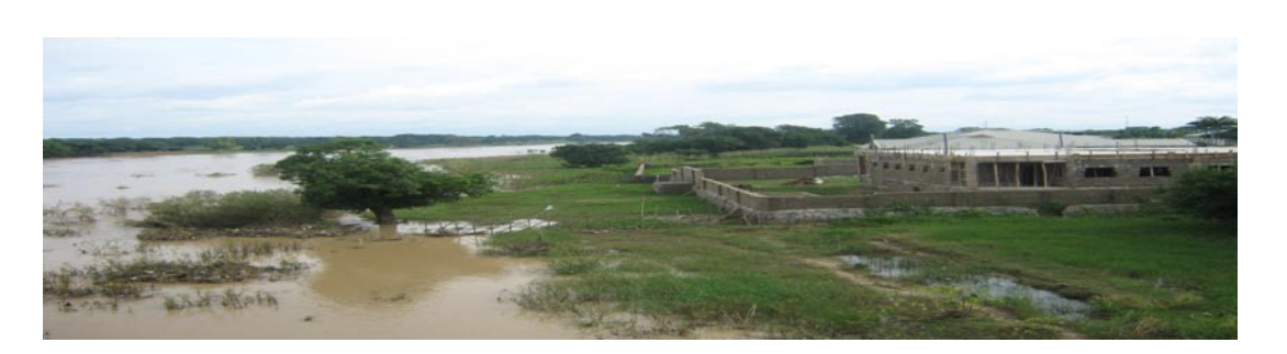
Figure 1 Typical Cross Section in Reach II and Floodwall Protection Structure

The extent of flood risk zones corresponding to the 2yr, 5yr, 10yr, 25yr, 50yr, 100yr and 200yr flood levels were determined by reading off the water stages corresponding to these flood levels discharges on the rating curves established for each of the 59 cross sections. These levels were compared with the floodprone area elevation and the maximum elevation in the cross section. Where maximum elevation in the cross section is less than the flood level elevation, or the flood level elevation is greater than the floodprone area elevation then there is the risk of flooding.