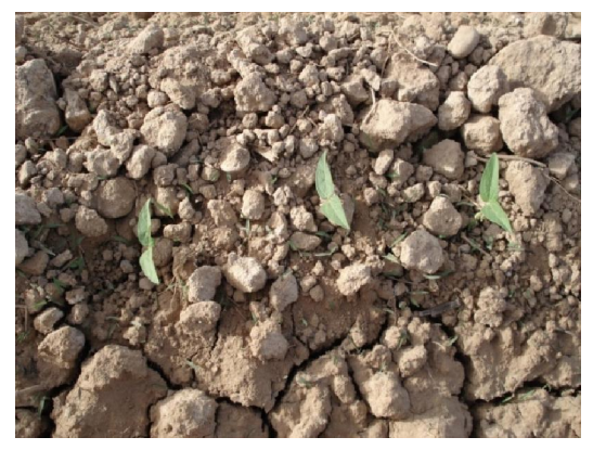
Latitude: 31 degrees 33 minutes elevation are higher sea: 13 m, Geographic: 48 degrees and 10 minutes Average Annual Rainfall: 248.5 mm

2.1. Profile geographic and climatic conditions This test on a farm located in the city HAMIDIH summer 1389 with the following geographic profile was: