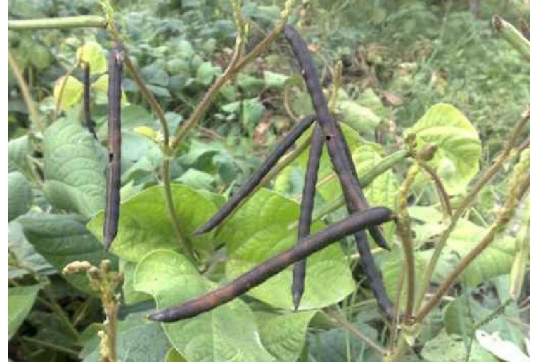
corroborated from other reviews to reduce grain yield is affected by drought.

Stress, especially in the growing stage, reduces the capacity of the source plants for the source and sink is forced to balance the number of flowers and pod production to reduce the stress that can handle grain filling period and also reduced and the final yield is reduced. The results also