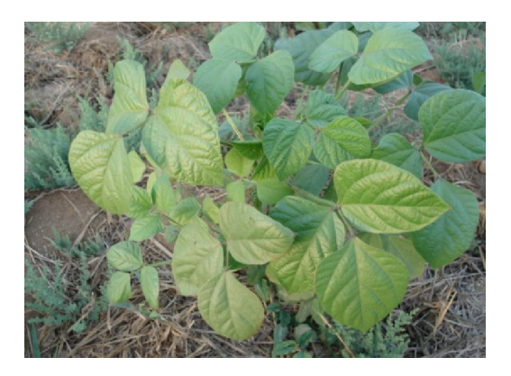
Fig5: mungbean harvest