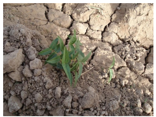
Fig2. Trifoliate stage of a mungbean