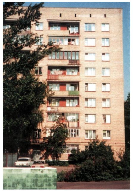
Fig 3: Social housing after war in Moscow -1948 Location: Krowinski shoes in Moscow. Reference from Residential Library, pp. 39 Publication: Moscow House Research Center

These explanations result from universal experience (especially after the Second World War). In 70 years ago, countries such as Russia, Germany and France tried to build houses for war refugees, thus it formed a strange and unknown architecture of Social housing in the limitation of time and economic context. For example, in Russia a Social housing, called Khoroshosfki, take the responsibility of war refugees' houses. (Fig 3).