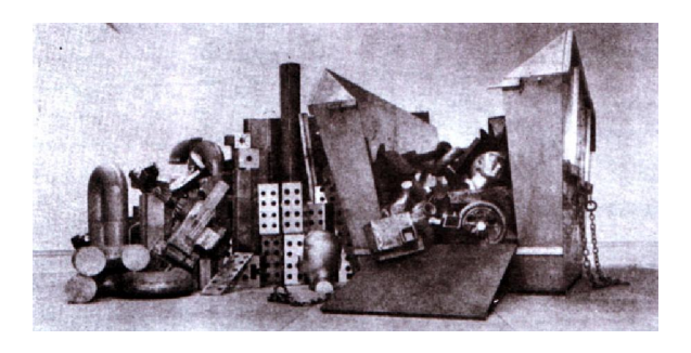
Fig 1: "The entire thing in the nature and history are art works that speak to us explicitly." (Gadmer)

The population of under-developed countries is increasing, so the land value is increasing too. House is considered as a material, and human especially in large cities will face a serious problem. It's such a serious problem that its solving is the most important concern of planner in recent decades. (Figure 2)