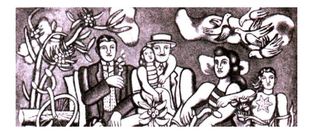
Fig 2: Forghan Leje- memorial of Lui David -1948-49 National Modern Art - Paris

Today, even the most optimistic house planners accepted that the cheapest house with simplest design is beyond the financial ability of at least one out of third families of the third world countries<sup>4</sup>. So Social Housing is formed to resolve the problems of families with low income. It always is the form of minimization in large scale. In common view, Social Housing means access to a constructional system. This kind of house has an architectural regular volume, and also is cheap. Mass production with industrial and traditional methods is possible, and materials are not waste in structure, and the house is placed on the Frame of Modulation System as much as possible.