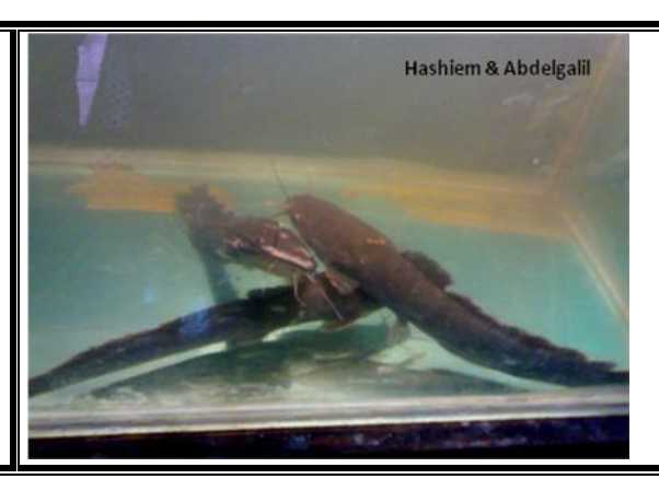
Photo (4&5) C. gariepinus fish in the aquarium showed areas of depigmentation and fin disintegration