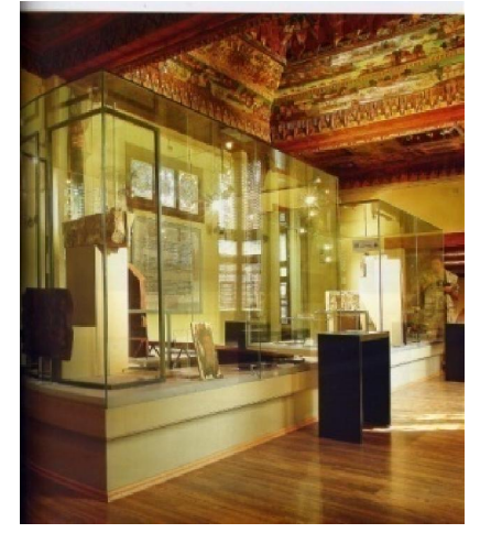
Fig (1a)The display glass cases at the Coptic museum facade

such dusty atmosphere were not studied, especially with some display glass cases being placed beside open windows, resulting in their being subject to