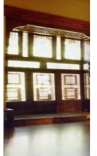
Fig (1b)Using natural ventilation at the Coptic museum

collision. Fig. (1a, 1b) show the glass cases which were used in the museum after the renewal processes and the glass windows from inside the museum.