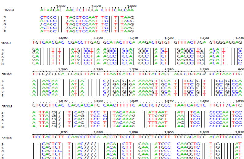
Figure (1) G-----A Mutation