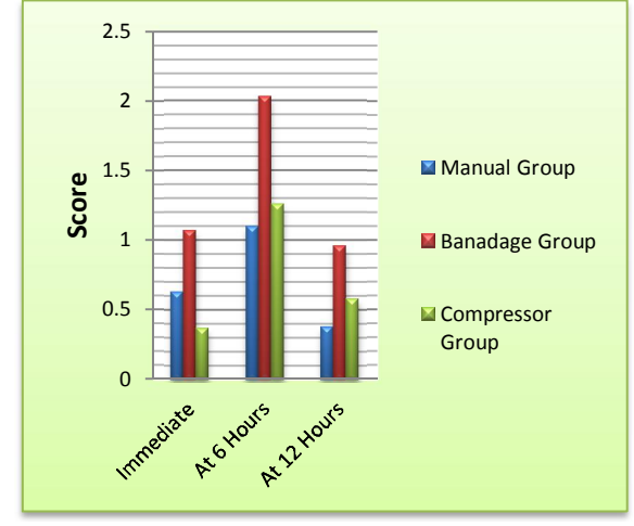
Figure 3. Mean Scores of Oozing Scale among Patients in the Three Study Groups throughout Study Periods

The comparability of the catheterization sheath size among patients in the three groups was also important to be able to compare outcomes with no confounding factors. Thus, in the majority of the patients, sheath size 7 was used, with no statistically significant differences among the three groups. This result is in line with Magosaki et al.(1999) who have similarly mentioned that A7, 8F sheaths were mostly used among patients undergoing percutaneous coronary procedures.