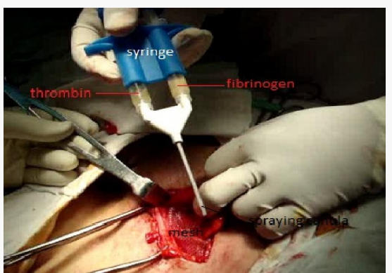
Fig.3: Mesh fixed with fibrin glue.