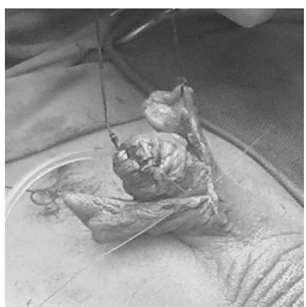
Figure 5. The glandular wings were closed without tension.