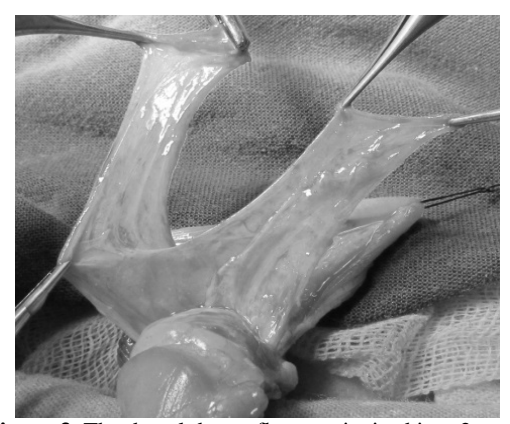
Figure 3. The dorsal dartos flap was incised into 2 equal strips.