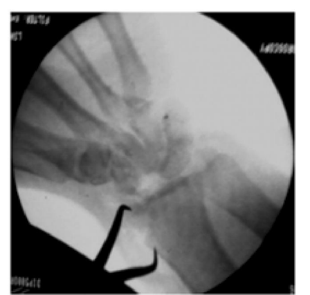
Figure 5: closure of the osteotomy site by reduction clamp