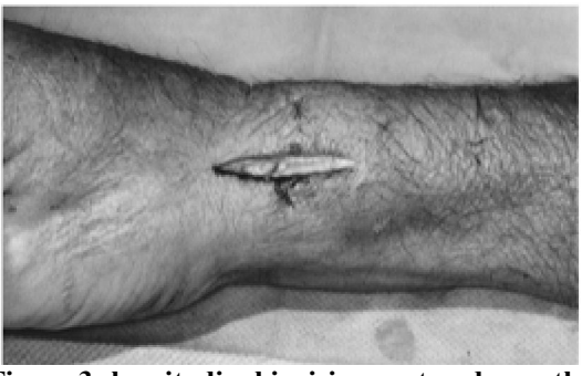
Figure 3: longitudinal incision centered over the radial styloid