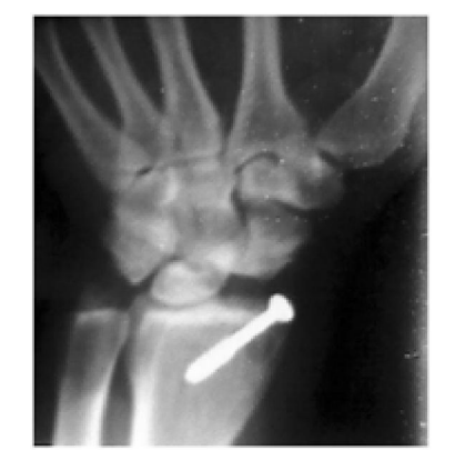
Figure 7: late follow up radiograph showing healing of the osteotomy site