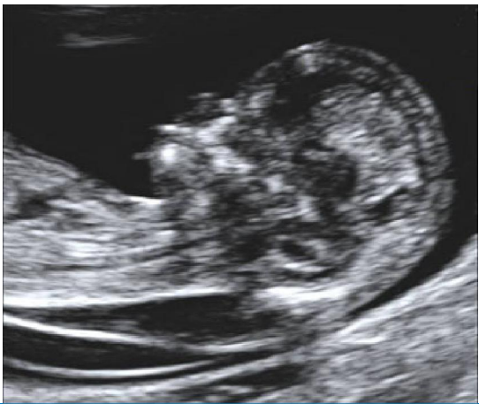
Increased nuchal translucency