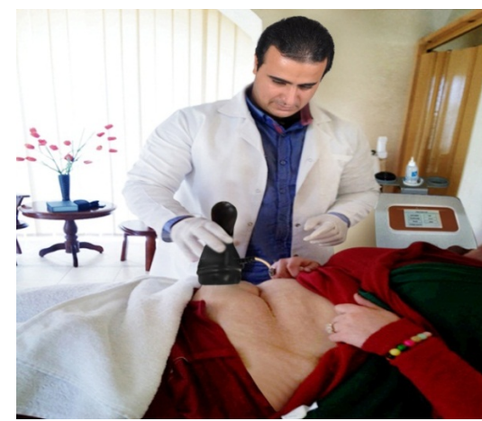
Fig.1: Application of UC on the abdominal area.

necessary after the process of accommodation not exceeding 900 micro amps.;50 min). After the delimitationand sterilization(70% alcohol) the area to betreated;disposableacupuncture needle0.30X75 mm, stainless steel and diamond tipswere introducedin the region ofthe abdomenlowerhorizontalinsertion in the AT), which were introduced into the region above and below the umbilicus, distribute of pairs ( Fig.2 ). Needles were placed so as to cover the entire area to be treated. The distance between the needles was 6 cm<sup>(2,15 and 16)</sup>.