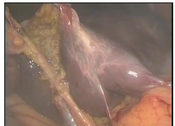
Figure 4 pedicle of the gallbladder