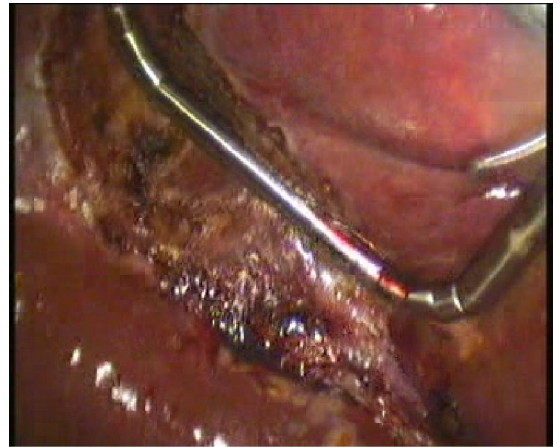
Figure 7 gallbladder bed at the end

Consensus tatement. NIH; September 14-16, 1992. 10(3):1-28.