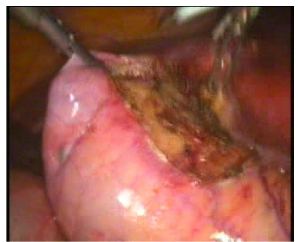
Figure 1 fundus dissection

It was our impression that the technique was easy to learn with a short learning curve, and it is therefore recommended that laparoscopic surgeons acquire this technique for use as a secondary approach when faced with a difficult case.