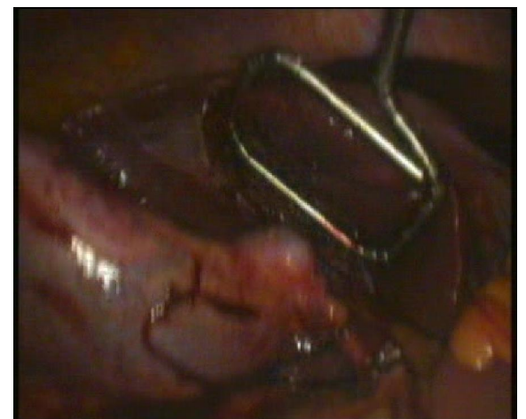
Figure 5 clipping of cystic duct