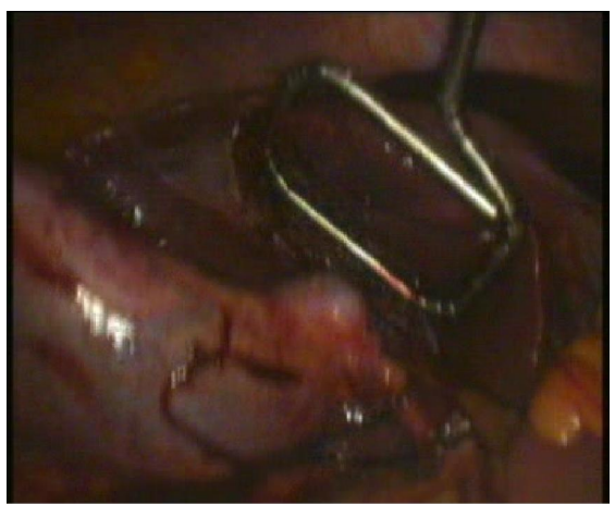
Figure 3 liver retractor at the gallbladder bed