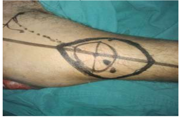
Fig. (3) Pre-operative detection of perforators together with marking of the flap borders.

• Dissection of the descending branch was completed in a proximal direction in the intrermascular septum between rectus femoris muscle and vastus latetralis muscle up to the lateral circumflex femoris artery.