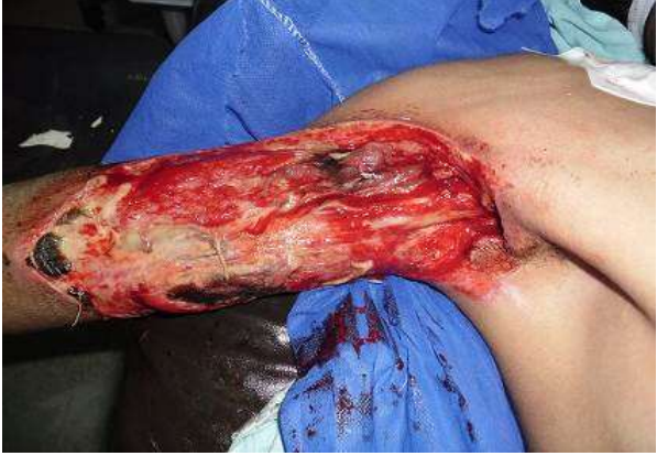
(Fig.7). Preoperative photo showing post electrical burn raw area of the right axilla and proximal arm with exposed neurovascular structures.

of the left upper extremity and raw area of the right upper extremity affecting the axilla and proximal arm with exposed neurovascular bundle (Fig.7). Necessitating an urgent reconstruction to save his precious limb .vertical branch muscle sparing latissmus dorsi flap was harvested for urgent coverage of the right axilla and arm. (Fig.8). the surgery was uncomplicated and the wounds have healed well.