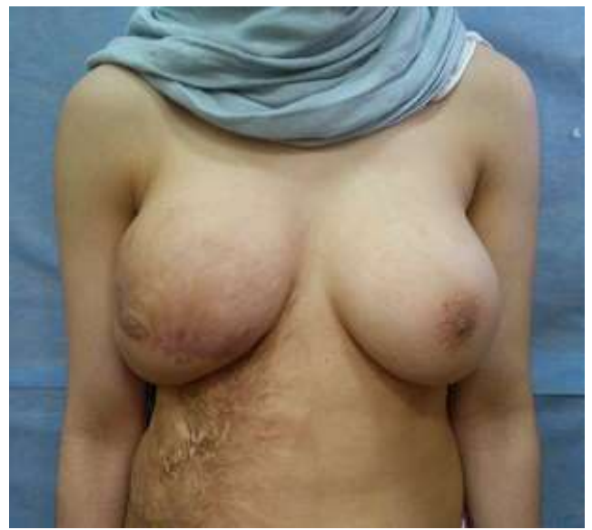
(Fig.10). Twelve months Postoperative photo showing full release of the contracted right breast with reconstruction of the inferior pole of the breast by Muscle sparing latissmus dorsi flap.