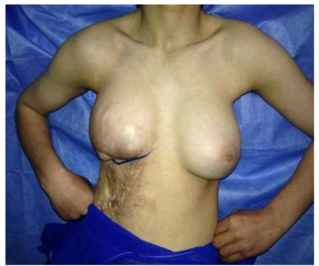
(Fig.9). Preoperative photo showing contracted right breast with obliteration of the right inframammary fold and inferior pole of the breast.

Case (2): 24 years old female patient who sustained a flame burn to chest and abdomen 20 year ago, her burns were allowed to heal spontaneously with resulting hypertrophic scarring of the abdomen and obliteration of the right inframammary fold ( Fig.9 ).vertical branch muscle sparing latissmus dorsi flap was utilized for release of the contracted breast together with reconstruction of the inferior pole of her right breast ( Fig.10 ). The patient had smooth postoperative recovery with no recorded complications in both donor and recipient sites.