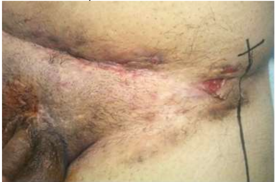
(Fig.5). Preoperative photo showing left groin severe hidradenitis suppurativa.

smelling discharge. A decision was made to perform a radical excision and reconstruction using pedicled muscle sparing vastus lateralis myocutaneous flap ( Fig.6 ). The surgery was uncomplicated and the wounds have healed well. The patient has no ongoing symptoms and has returned to his full previous activity.