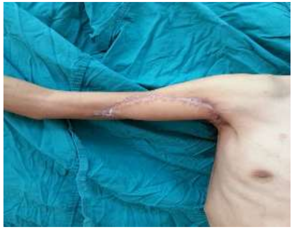
(Fig.8). Twelve months Postoperative photo showing well healed recipient and donor sites.

Case (2): 24 years old female patient who sustained a flame burn to chest and abdomen 20 year ago, her burns were allowed to heal spontaneously with resulting hypertrophic scarring of the abdomen and obliteration of the right inframammary fold ( Fig.9 ).vertical branch muscle sparing latissmus dorsi flap was utilized for release of the contracted breast together with reconstruction of the inferior pole of her right breast ( Fig.10 ). The patient had smooth postoperative recovery with no recorded complications in both donor and recipient sites.