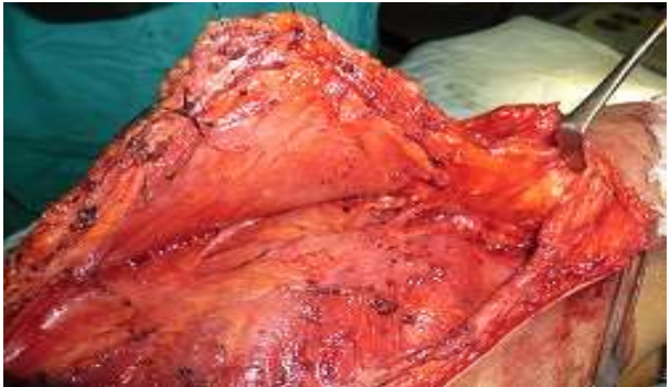
Fig. (1) Intraoperative view showing the cleavage plane between latissmus dorsi and serratus anterior muscles with visible serratus anterior artery siphon.

• The medial incision was made down to and through the deep fascia, exposing the rectus femoris muscle.