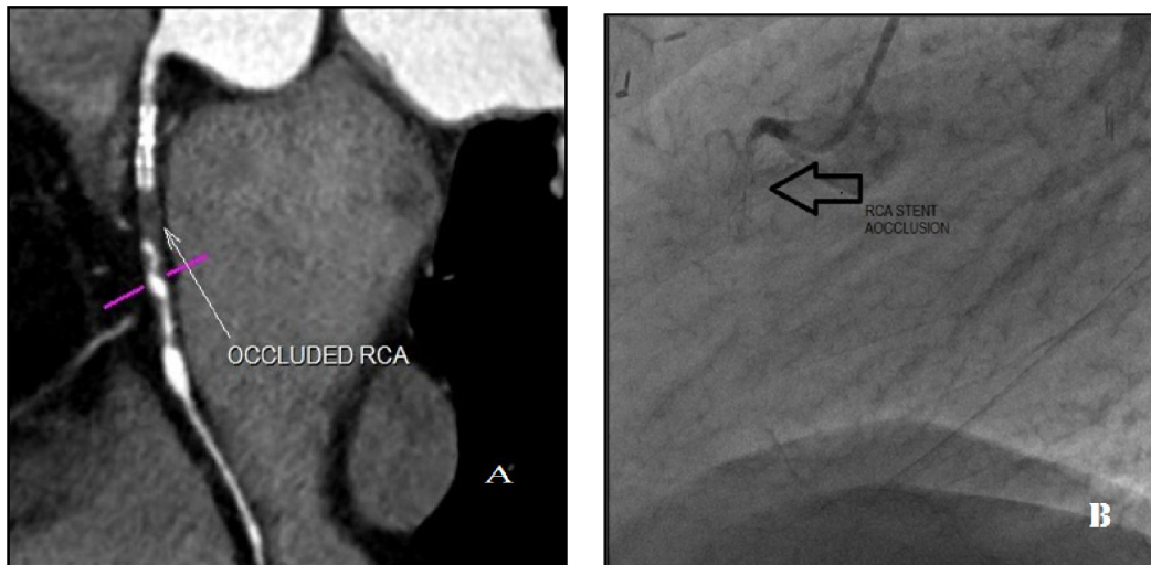
Figure (1): 65 years old male patient, he is diabetic and hypertensive. A bare metal 3x12 mm stent is placed in RCA 7 months ago. (A) MDCT angiography in MPR shows occluded stent in RCA. (B) Catheter angiogram confirmed the occlusion of stent in RCA.