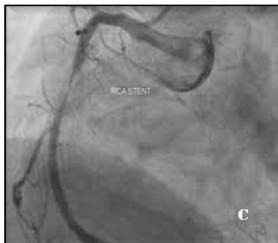
Figure (3): 43 years old female patient, she is diabetic and hyperlipidaemic. A bare metal 3x 15 mm stent is placed in mid RCA before 7 months. (A) MDCT angiography axial image shows crescent shape hypodensity encroaching upon the lumen causing an in stent restenosis, (B) MDCT angiography in MPR image shows the in stent restenosis in stented RCA segment. (C) Catheter angiogram confirming the in-stent restenosis.